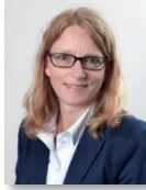
OPERATIONS A. Wolving