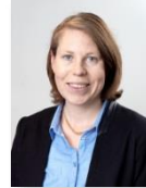
ACCOUNTING S. Dahlskog